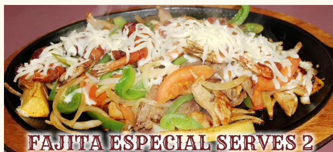
FAJITA ESPECIAL SERVES 2