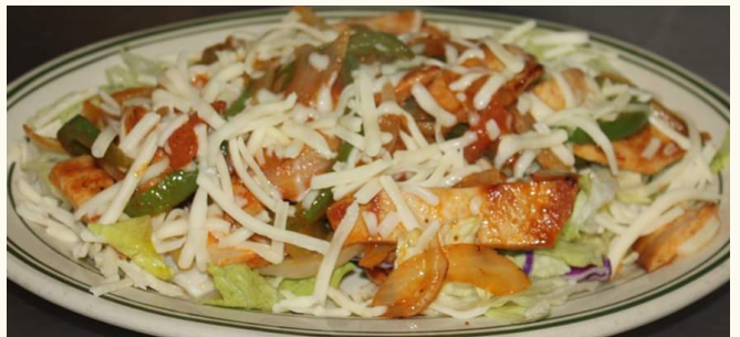
CHICKEN FAJITA SALAD