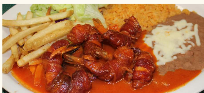
CAMARONES CON TOCINO A LA DIABLA