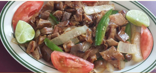
BOTANA DE BUCHE